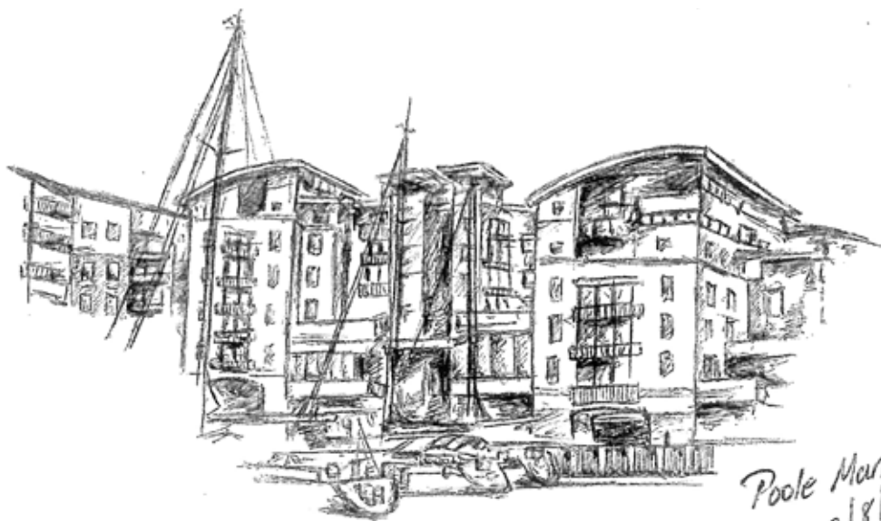
Poole Marina 3/8/14 (Day 2)